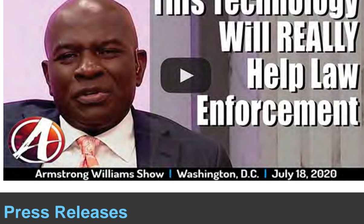
Armstrong Williams Show | Washington, D.C. | July 18, 2020