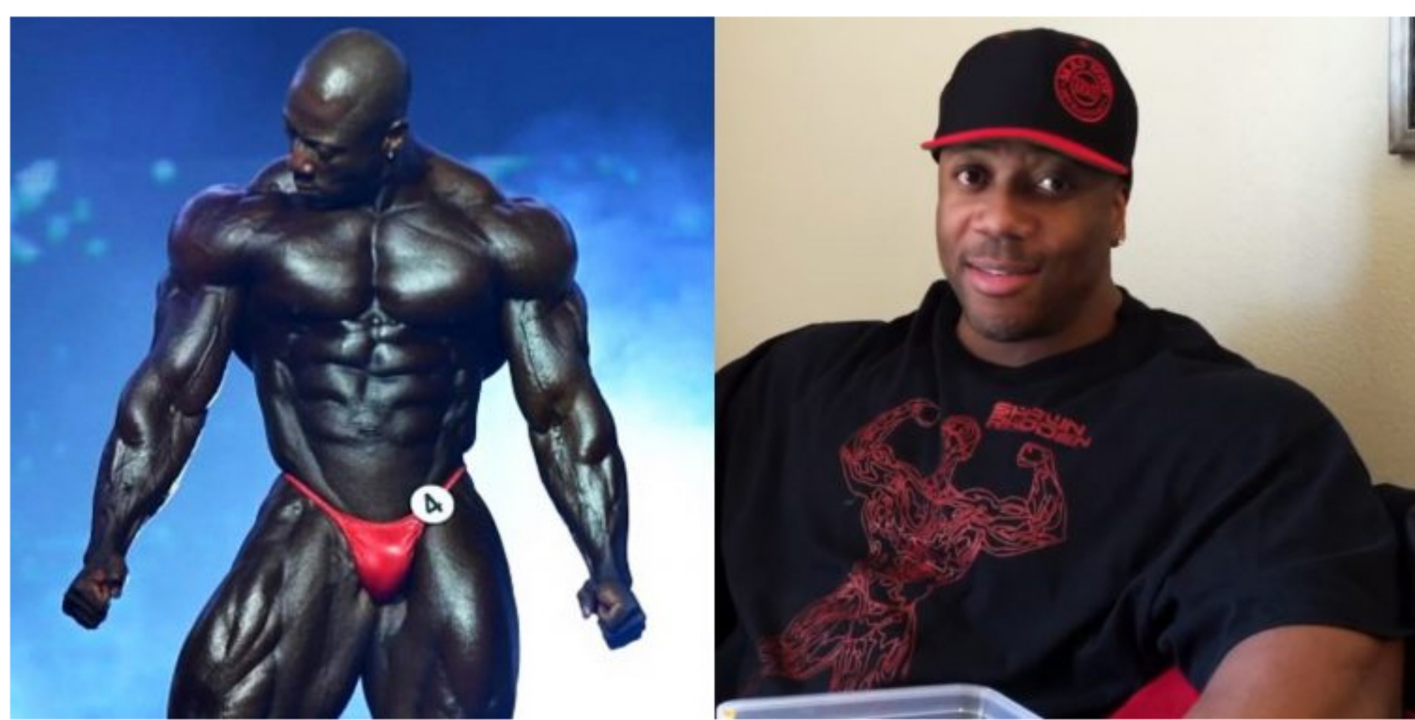
Shawn Rhoden

by Derek Hall — July 30, 2019 in Bodybuilding, Mr. Olympia, News