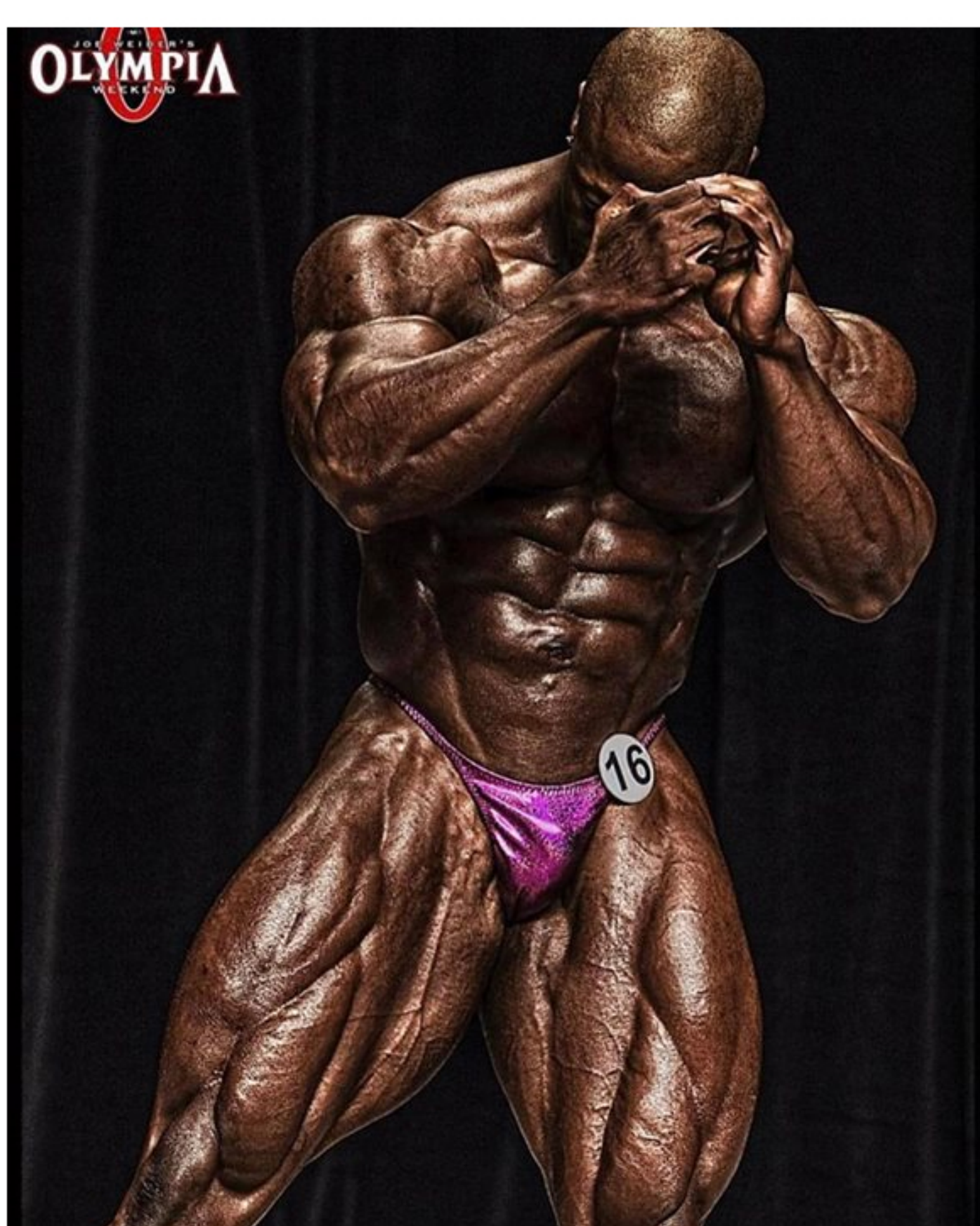
Shawn Rhoden Mr. Olympia 2018

Rhoden was supposed to attempt to defend his Mr. Olympia title, at this year's event.